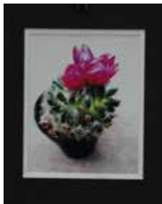
2nd Place - "Cactus" by Travis Hoover.