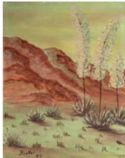
"Southwestern Yucca" Oil Painting by Bonnel.