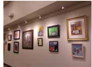
Exhibit on Display through February 1, 2020

On September 28, the Arts Alliance, in partnership with the Charles County Public Library, opened a new art exhibit at Waldorf West Library. The Gallery is located on the first floor of the Library, in the main conference rooms.