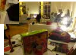
The Silent Auction offered a variety of items to bid on.