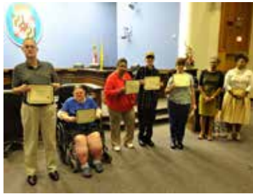
Artists proudly display their certificates.