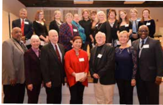
The FY 2018 Grant Recipients