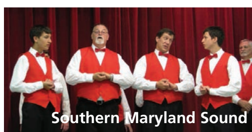
Southern Maryland Sound