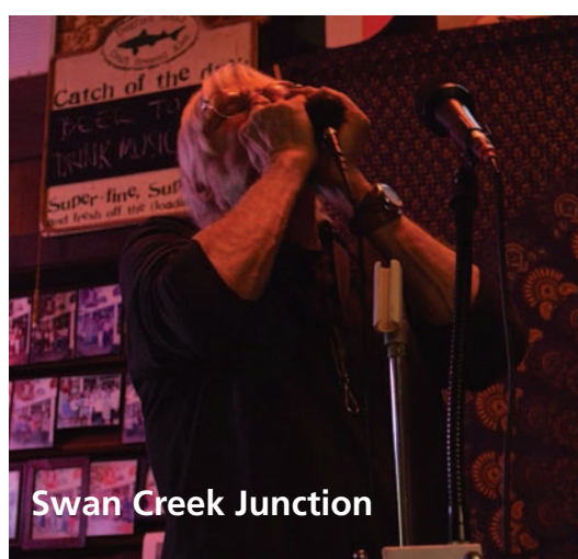
Swan Creek Junction

The Charles County Arts Alliance is pleased to present the following great music entertainment throughout the day at ArtsFest 2016!