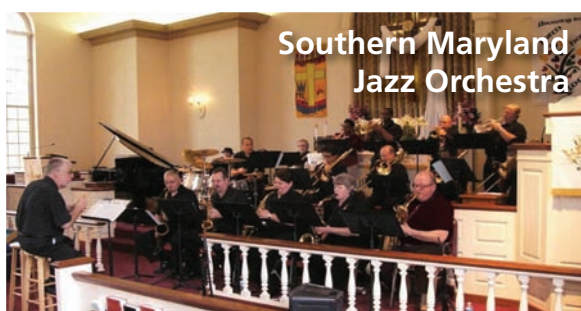
Southern Maryland Jazz Orchestra