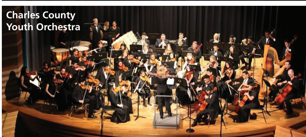
Charles County Youth Orchestra