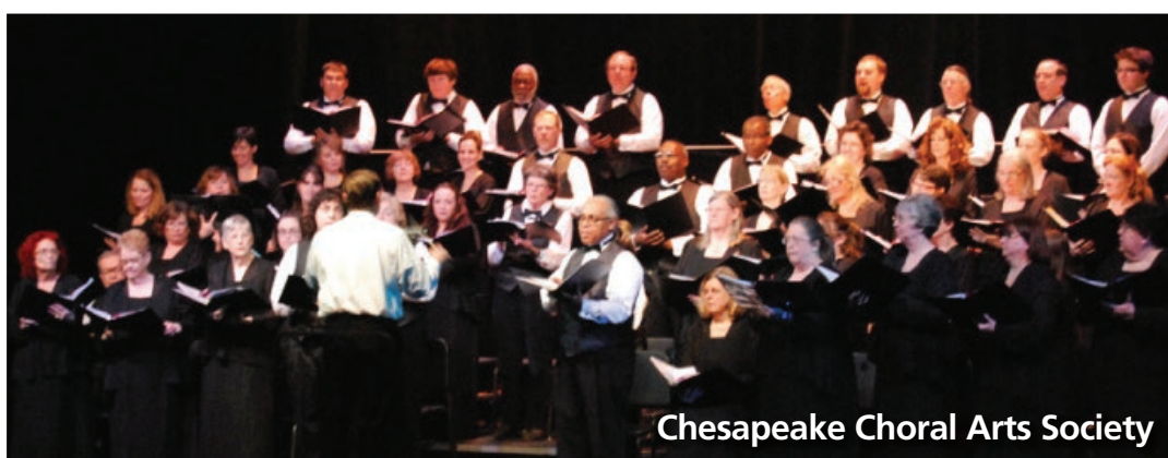
Chesapeake Choral Arts Society