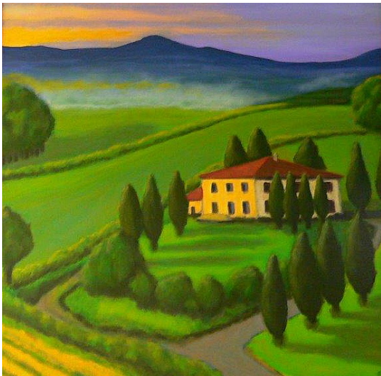
Sunrise Tuscany by Ernest Sinnes, Charles County Artist